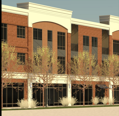
TABLE OF CONTENTS MULTI FAMILY & MIXED-USE